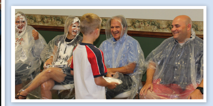
Aultman Orrville Annual Picnic

Through the United Way campaign, employees showed their generosity and commitment to the communities they serve. In 2012, employee donations exceeded $12,000.